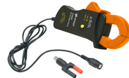
U1583B AC current clamp