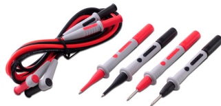
U1169A test probe leads

Includes two test leads (red and black), and a pair each of 19-mm and 4-mm test probes.