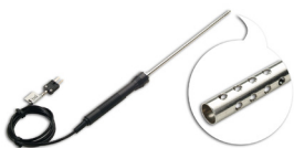
U1183A air temperature probe