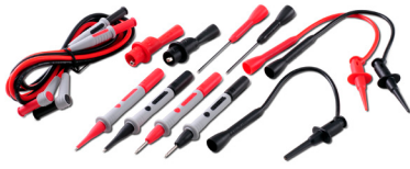
U1168A standard test lead kit

Includes two test leads (red and black), 19-mm and 4-mm test probes, alligator clips, fine-tip test probes, SMT grabbers and mini grabber (black).