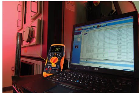
Figure 1. Automate recording of measurements with bundled GUI data-logging software.

Offering the same functionality as the U1252B, the U1253B is the world's first OLED handheld DMM. You won't have to squint to be sure you're reading it right: On the go or on the bench, you'll get crystal-clear viewing indoors, even in dark, off-angle situations.