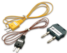
U1180A thermocouple adapter+lead kit, J and K types

Includes thermocouple adapter, thermocouple bead J-type and thermocouple bead K-type.