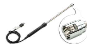
U1182A industrial surface temperature probe