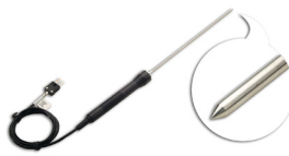
U1181A immersion temperature probe